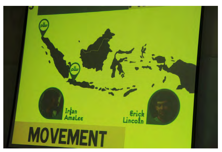
Slide presentation of Peace Generation

Preventive efforts as alternative towards conflict resolutions, and it would even more appropriate if it was presented in the form of movement. Essentially, the intended movement should involve a massive awareness that considered it as a shared issue. In this case, it could be formulated through a keyword: peace movement.