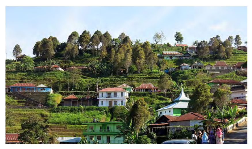
Al-Urwatul Wutsqa Islamic boarding School in Karanganyar

Time passed by and the sun was setting. IYP journey continued Buddhist Vihara where it looked magnificent from the outside and we would find the magnificent Buddha statue when we entered. In this temple I sensed the similarity to Hinduism, Confucianism, particularly on the subject of the God they worship. God for Buddhist is indescribable substances by human beings, and the Buddha is not a God they worship but actually resembling an act of respecting holy figure with Nirvana as the final destination. Some of the sanctuaries we have visited have brought a new insight to me where God is an indescribable substance, there are diverse ways of worshiping, and symbols are used to vary one religion from another. In short we were not that different, but diverse.