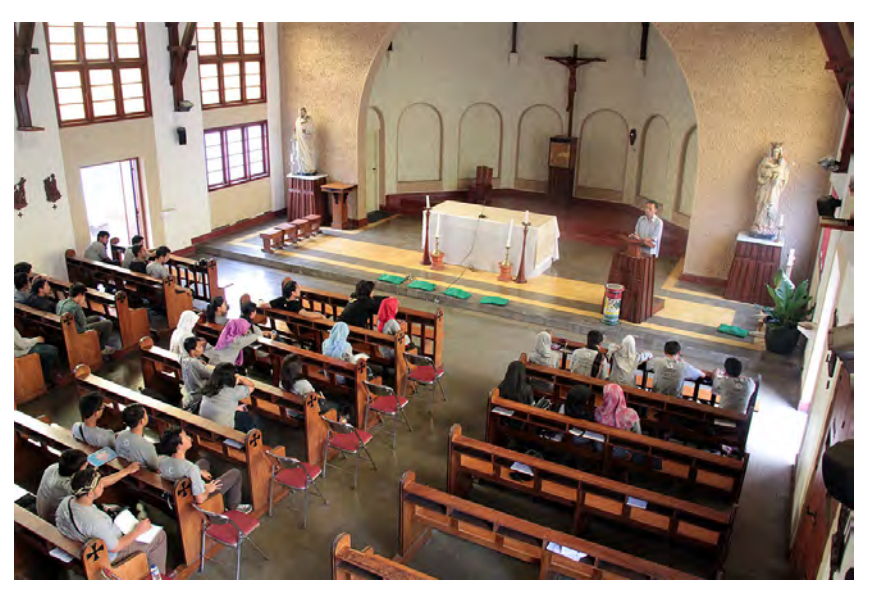
IYP participants visit Mertoyudan Seminary in Magelang

Interfaith Youth Pilgrimage 2013 program had passed and left millions of precious memories to me. My spirit was everything but deflated for carving every experience I had been through with other participants.