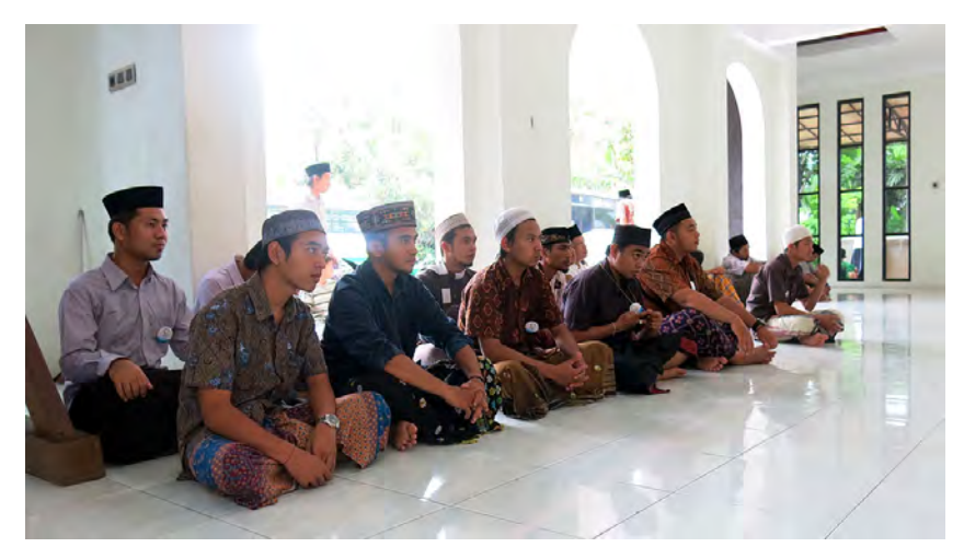
IYP Participants observe the Friday Prayer

ing. I saw him very seriously and paid attention to his mouth because I was curious about his whispered sentences. However, with all due respect, since I did not understand Arabic it made me laugh a little. But then I saw how seriously he performed it, so I became conscious to pray too. My movements followed the way Islamic people worshiping their God but I chanted the Christian wordings during the prayer.