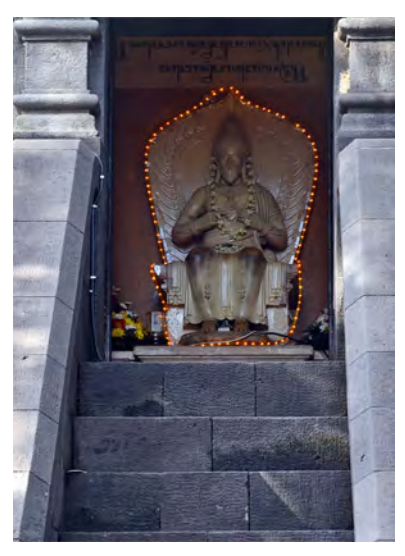
Jesus in a temple

Sacred Heart of Jesus Ganjuran Church showed that the spirit of difference was something beautiful and should not be a reason for separation. With enculturation and tolerance made in this church, people in the surrounding area and even wider public were inspired to live side by side within the differences and diversities across cultures and religions.