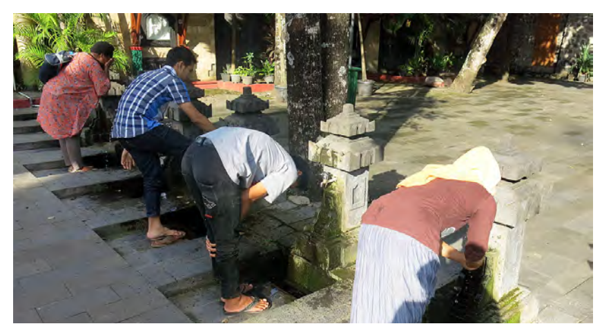
the Holy water