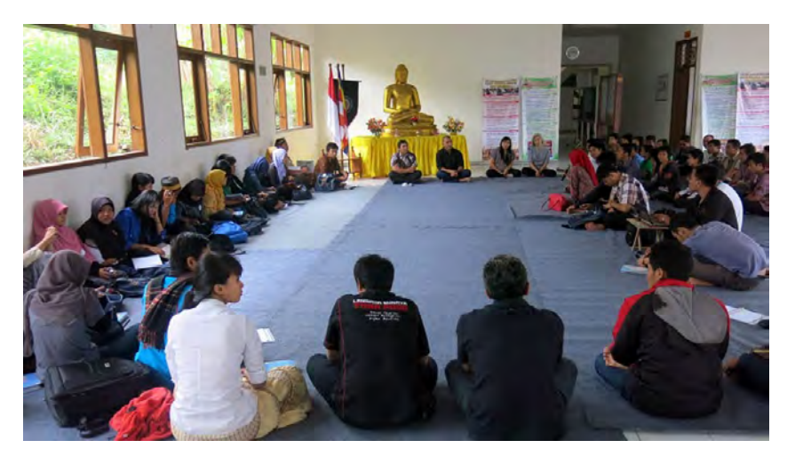
IYP Participants listen to the Buddhist leaders at Syailendra Buddhist College Salatiqa

As the name suggests, Interfaith Youth Pilgrimage, further highlighted the inner reflections from experiencing the sacred places of various religions' visitation in Indonesia. The youths were invited to enter the "sacred spaces" of other religions to be able to understand the others. Given such experiences, these young people were expected to better appreciate individual differences and to respond wisely to it.