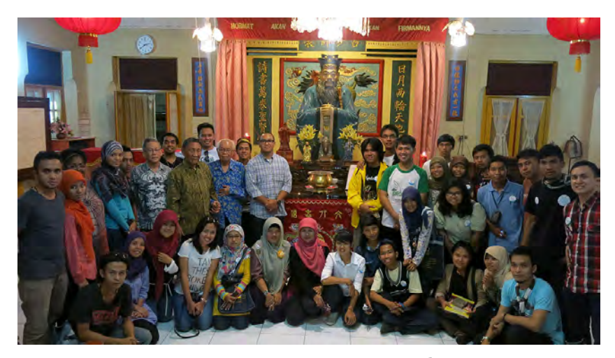
IYP Participants visit MATAKIN Solo

spaces is what is the importance of a person to know and enter the sacred realm of other faiths? What happen when a Muslim enters the temple and sits between Hindus people who attend a prayer? Also what about the Christians who enter the mosque and spend the whole night in discussion with the students at an Islamic boarding school? Or Muslims who stay in the homes of church members?