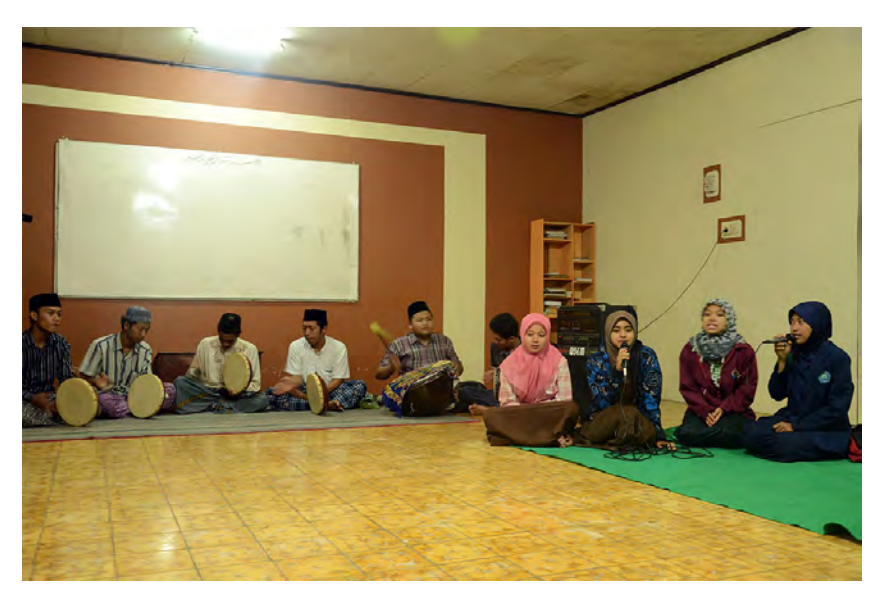
Students at the Edi Mancoro Islamic Boarding School play rebana music

Salatiga was one among many destinations to visit. When we reached Pesantren Edi Mancoro, my heart was touched and my mind worked harder than usual.